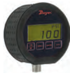
DPG-100 with Protective Rubber Boot