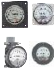
Flush, Surface or Pipe Mounted

Note: May be used with hydrogen. Order a Buna-N diaphragm. Pressures must be less than 35 psi.