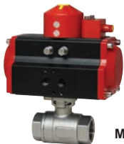
Model VPS and P1 mounted on an actuator