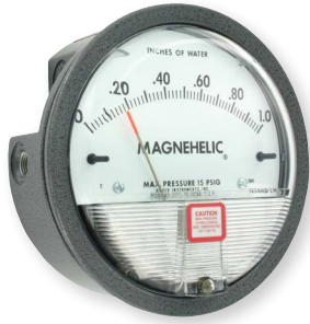
Standard Magnehelic® Gage