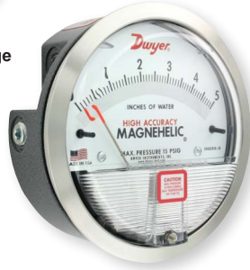
High Accuracy Magnehelic® Gage Note: Shown with optional -SS bezel