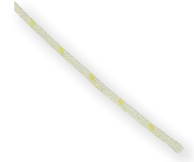
K type - FB