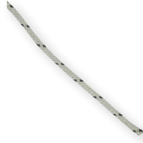
J type - FB