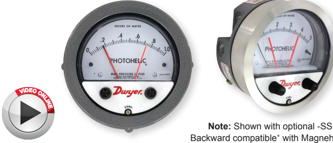
Note: Shown with optional -SS bezel. Backward compatible* with Magnehelic® gage.

Combines Differential Pressure Gage with Low/High Set-Points, Compact Size