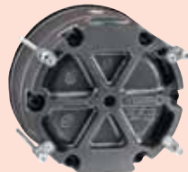
Back view shows flush mounting adapters.