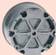
Back view for surface mounting.