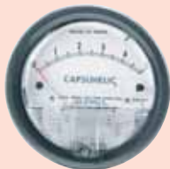
Flush mounted in panel.

Capsuhelic® gages may be flush mounted in a panel or surface mounted. Hardware is included for either. For flush mounting, a 4-13/16" diameter cutout in panel is required. Where high shock or vibration are problems, order optional A-496 Heavy Duty flush mount bracket. Optional A-610 kit provides simple means of attaching gage to 1-1/4"-2" horizontal or vertical pipe. Installation is same as Magnehelic® gage shown on page 4. All standard models are calibrated for vertical mounting. Gages with ranges above 5 in. w.c. can be factory calibrated for horizontal or inclined mounting on special order.