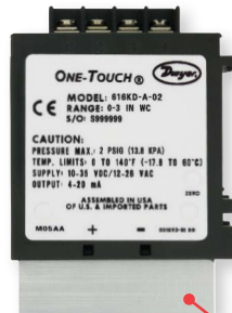
Optional NPT connection block