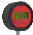
DPG with Protective Rubber Boot