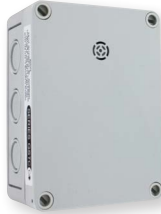
Wall Mount Without LCD