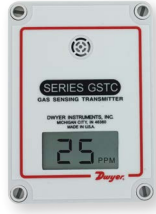
Wall Mount With LCD