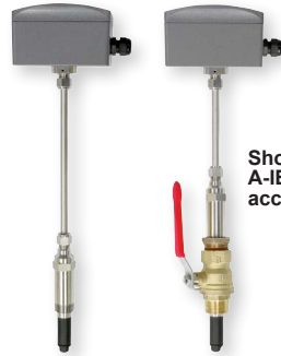
Shown with A-IEF-VLV-BR** accessory valve