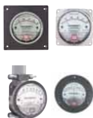
Flush, Surface or Pipe Mounted

Note: May be used with hydrogen. Order a Buna-N diaphragm. Pressures must be less than 35 psi.