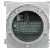
DCT in optional Explosion-proof Enclosure.