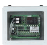
DCT in optional NEMA 4/4X weatherproof enclosure.