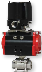
Mark Series mounted to an actuator

Mounting kits can be used interchangeably with all models since external mounting features are identical. Rotary valves utilize direct drive couplings and a slotted lever drive is used with linear valves. Lever drives convert linear motion to rotary. Stainless steel visual indicators are standard for direct drive, automated quarter-turn valve applications.