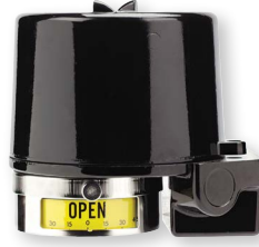
Mark 1 polyester coated aluminum (environmentally sealed for corrosive areas)