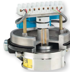
Mark 4 thru-shaft cutaway Model 42RDOJ2