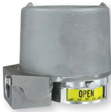
Mark 1 stainless steel (environmentally sealed for corrosive areas)