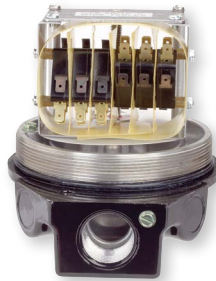
Mark 3 multi turn