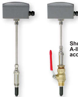
Shown with A-IEF-VLV-BR** accessory valve kit