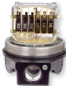
Mark 3 multi turn